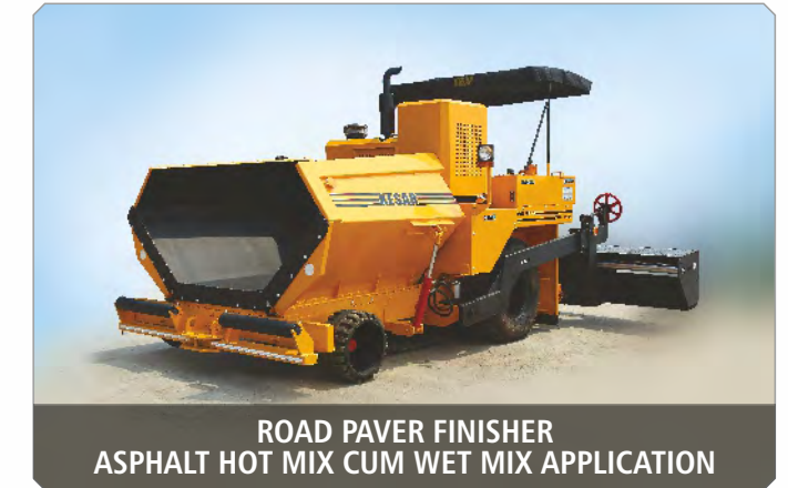
ROAD PAVER FINISHER ASPHALT HOT MIX CUM WET MIX APPLICATION