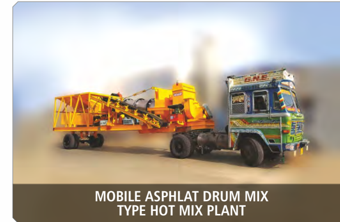
MOBILE ASPHALT DRUM MIX TYPE HOT MIX PLANT