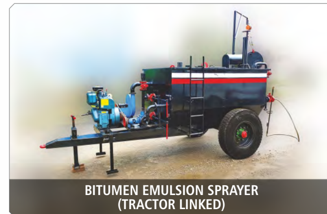
BITUMEN EMULSION SPRAYER (TRACTOR LINKED)