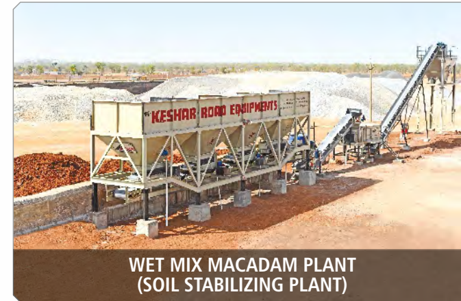
WET MIX MACADAM PLANT (SOIL STABILIZING PLANT)