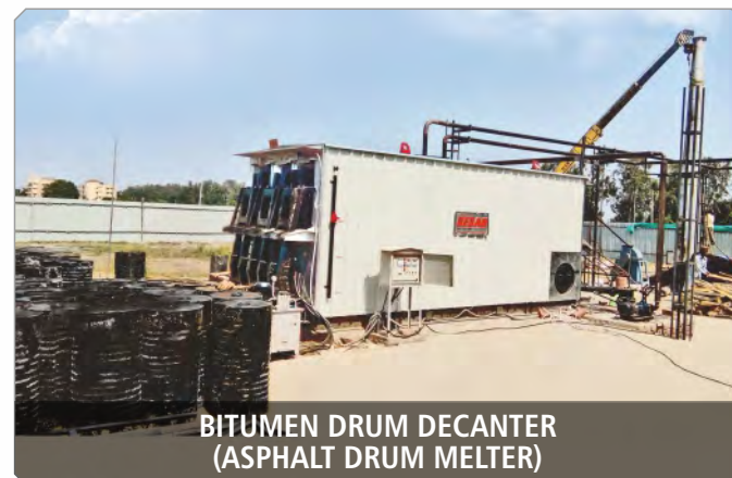
BITUMEN DRUM DECANTER (ASPHALT DRUM MELTER)