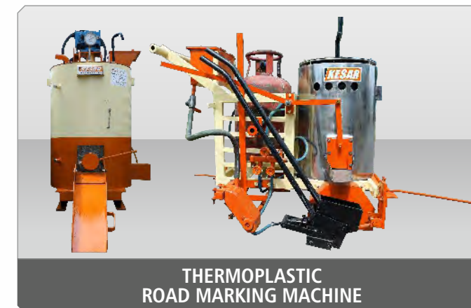
THERMOPLASTIC ROAD MARKING MACHINE