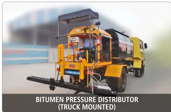
BITUMEN PRESSURE DISTRIBUTOR (TRUCK MOUNTED)