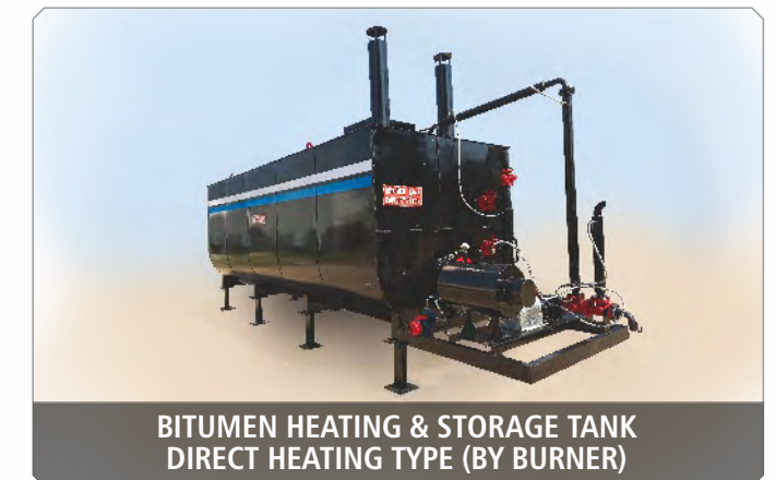
BITUMEN HEATING & STORAGE TANK DIRECT HEATING TYPE (BY BURNER)