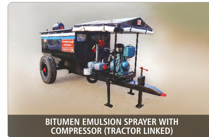
BITUMEN EMULSION SPRAYER WITH COMPRESSOR (TRACTOR LINKED)