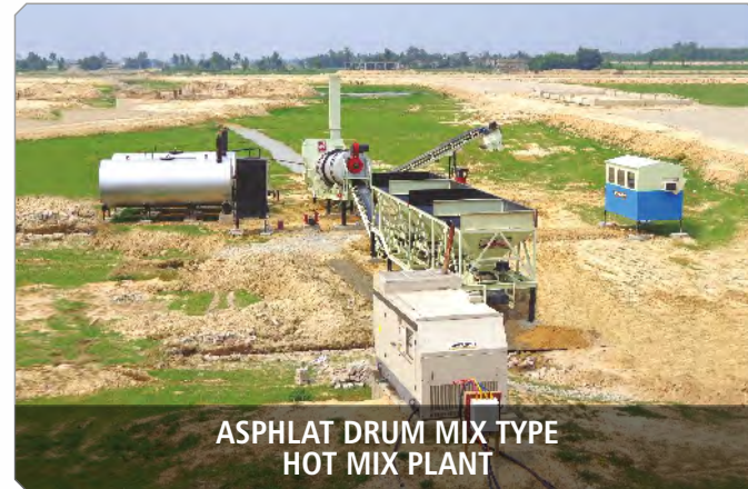
ASPHALT DRUM MIX TYPE HOT MIX PLANT