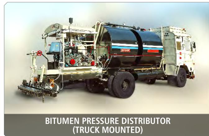
BITUMEN PRESSURE DISTRIBUTOR (TRUCK MOUNTED)