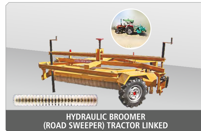
HYDRAULIC BROOMER (ROAD SWEEPER) TRACTOR LINKED