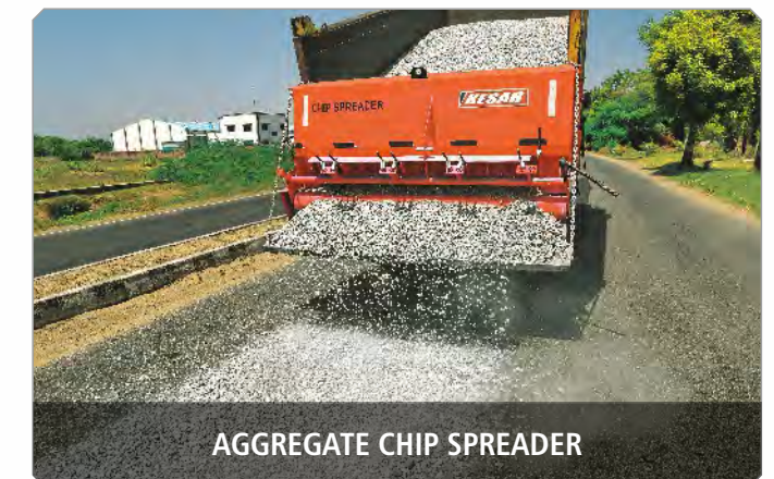
AGGREGATE CHIP SPREADER